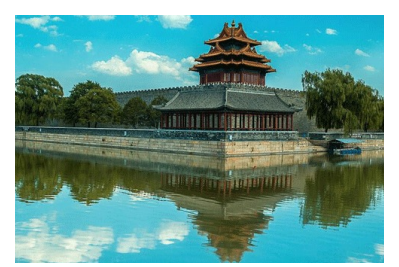
The Forbidden City