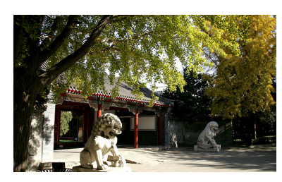
Tsinghua University: Rector's Office